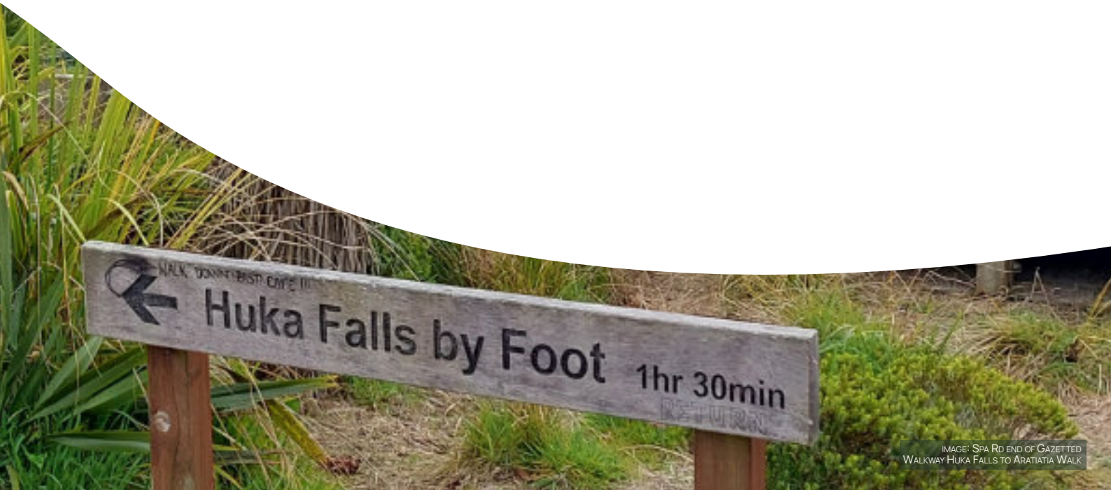
IMAGE: SPA RD END OF GAZETTED WALKWAY HUKA FALLS TO ARATIATIA WALK