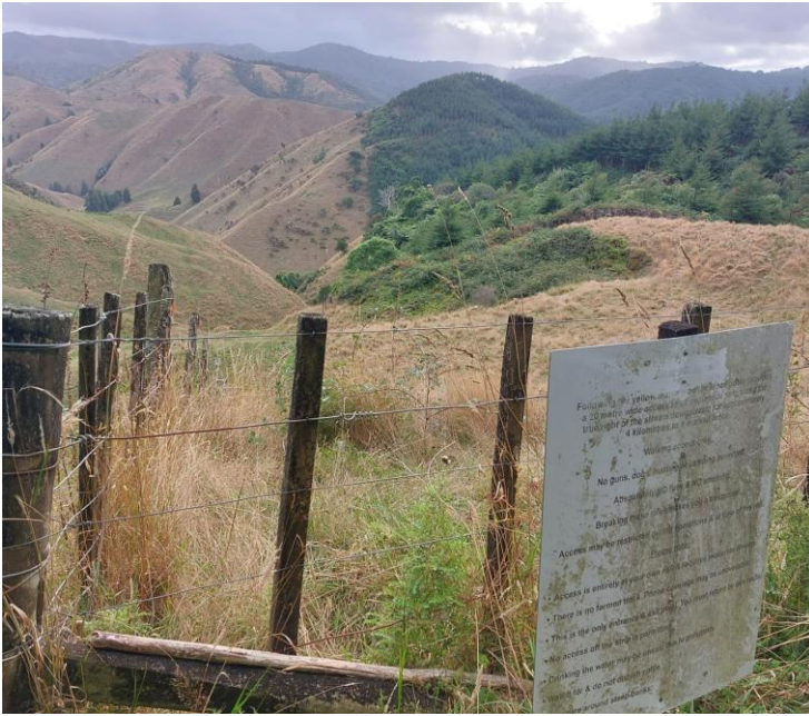
Photo 1 – sign with information about accessing the public access route in place on the Tapuae Road fence.

In order to provide you with further context in terms of the information you have requested, please note that our Regional Field Advisor visited the Tapuae Road end of the access route in February 2025 and took the following photos of the sign on Tapuae Road and the markers down the fenceline.