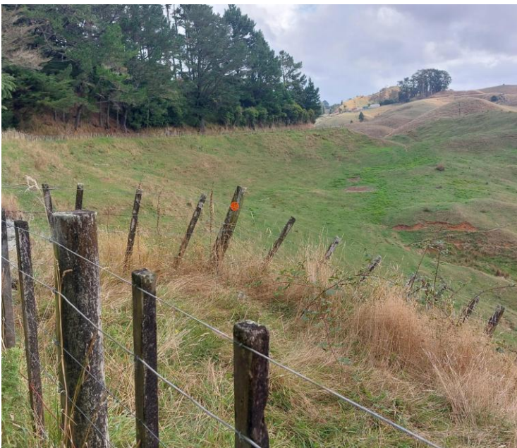
Photo 2 – orange marker on fence post on southern property boundary.